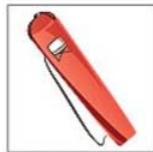
Folding Chair Bag (Folding Chair is Allowed)

FOR MORE INFORMATION GO TO PGATOUR.COM/ProhibitedItems