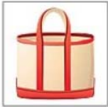
Over-sized Tote Bag