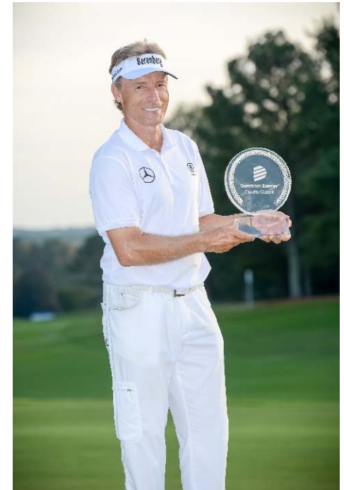
Bernhard Langer 2017 Champion

Name: Dominion Energy Charity Classic Date: October 18 – 21, 2018 Site: The Country Club of Virginia, James River Course Status: First of three PGA TOUR Champions playoff events for the Charles Schwab Cup Pros: Top 72 from the regular season Title: Dominion Energy Founding Partners: TowneBank, The Riverstone Group, VCU Health