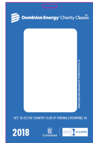
Special Access Credential